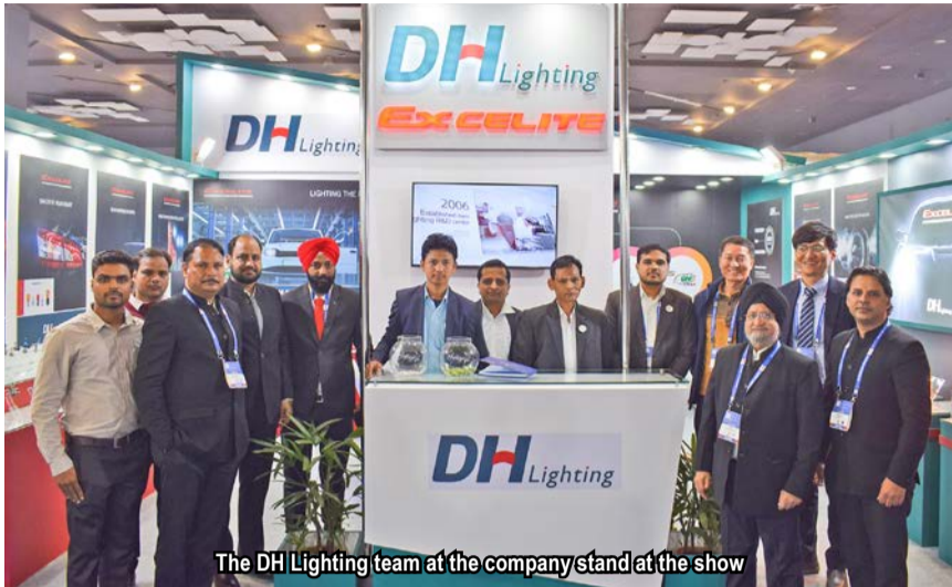
The DH Lighting team at the company stand at the show

After a successful acquisition of Innorex Technologies in Korea, DH Lighting is showcasing its new capabilities to offer LED lighting modules for automotive headlamps and rear combination lamps in India. The company is targeting both OEM and aftermarket business in LED modules in the domestic market.