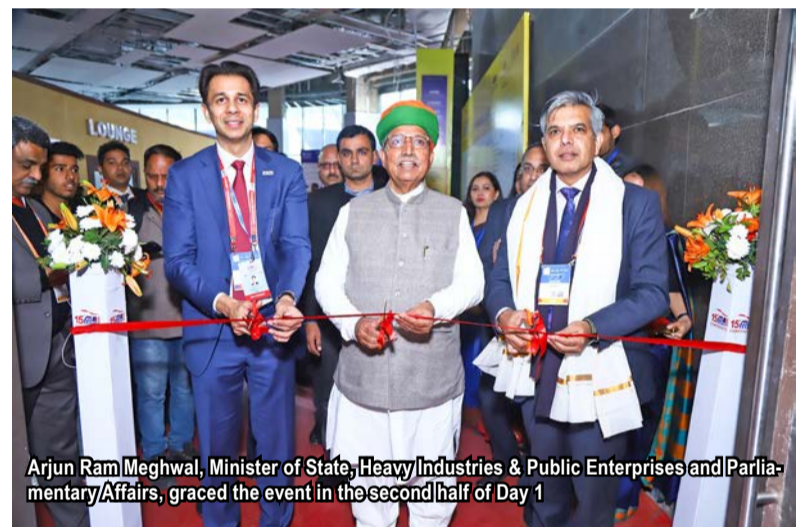
Arjun Ram Meghwal, Minister of State, Heavy Industries & Public Enterprises and Parliamentary Affairs, graced the event in the second half of Day 1

The first Auto Expo of the new decade and the 15th edition of the country's largest and most-awaited auto show, Auto Expo 2020 – Components, kicked off in grand style on February 6. The show was inaugurated by Arun Goyal, Secretary, Department of Heavy Industries, Ministry of Heavy Industries & Public Enterprises, in the presence of senior members from the three organizing bodies ACMA, CII and SIAM, auto component & auto industry captains, international delegations and a number of other distinguished guests.