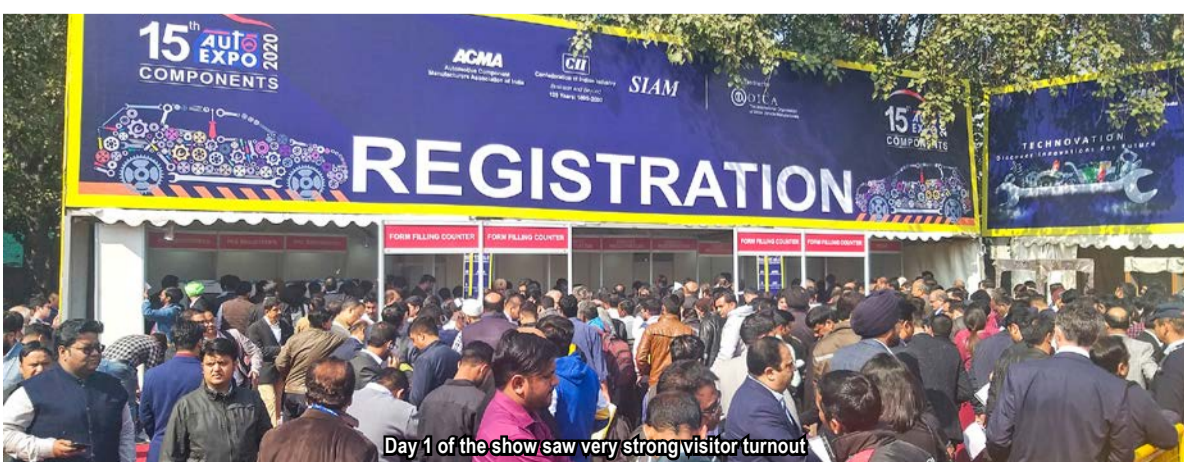
Day 1 of the show saw very strong visitor turnout