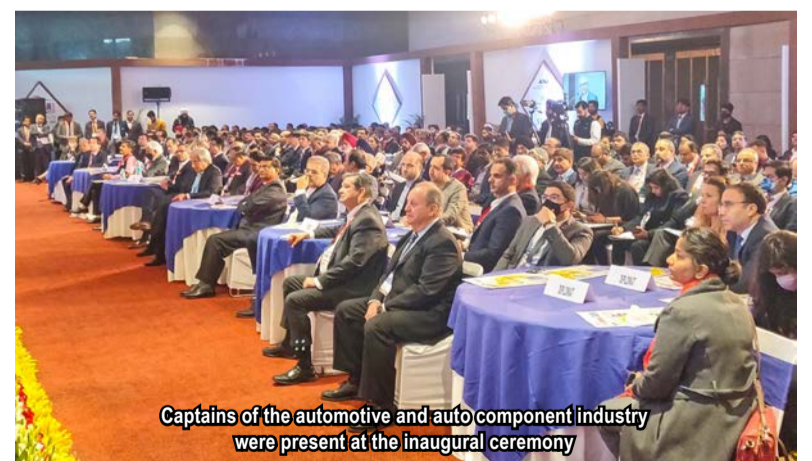
Captains of the automotive and auto component industry were present at the inaugural ceremony

Visitors can witness latest advancements in technology pertaining to BS-VI, safety, and e-mobility among various others. With export promotion and forging international relationships being a key focus area of the current expo, ACMA is also hosting an IPO Forum which will bring together International Purchase Offices (IPOs) of various multinational OEMs. The fair also has theme-based pavilions for EVs, Start-ups and Innovation in which several companies are displaying their prowess in specific segments. ♦