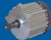
Electric Vehicle Motor